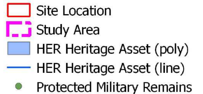
Figure 4b: Undesignated Heritage Assets within the Study Area